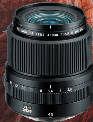
FUJINON GF45mmF2.8 R WR