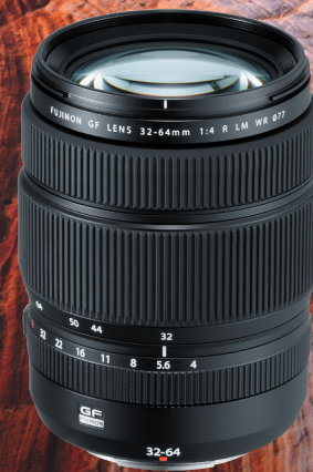
FUJINON GF32-64mmF4 R LM WR