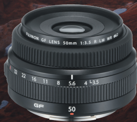
FUJINON GF50mmF3.5 R LM WR

ONLINE REDEMPTION REQUIRED FOR PREPAID MASTERCARD. SEE DETAILS BELOW.