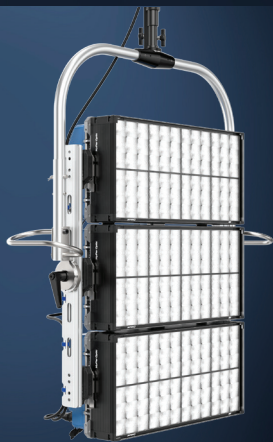
X23 Soft & Hard Light Package Set