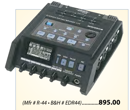
(Mfr # R-44 • B&H # EDR44)..... 895.00

The R-44 is a compact solid-state field recorder that can record up to four channels of uncompressed 16-bit or 24-bit audio at up to 96kHz, and two channels of audio at 192kHz. It features four balanced XLR / 1/4" combo mic / line inputs, with switchable phantom power for each input. There are also two built in condenser microphones for stereo recording, as well as coaxial S/PDIF digital I/O, line-level RCA inputs and outputs. Additionally, a control Sync terminal allows you to connect two R-44s together for a total of eight channels of audio. The R-44 records to SD or SDHC cards. Records for up to four hours using only four AA alkaline or NiMH batteries.