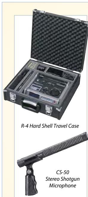
R-4 Hard Shell Travel Case

Includes AC adapter, USB cable, carrying case with shoulder strap ..... 1995.00